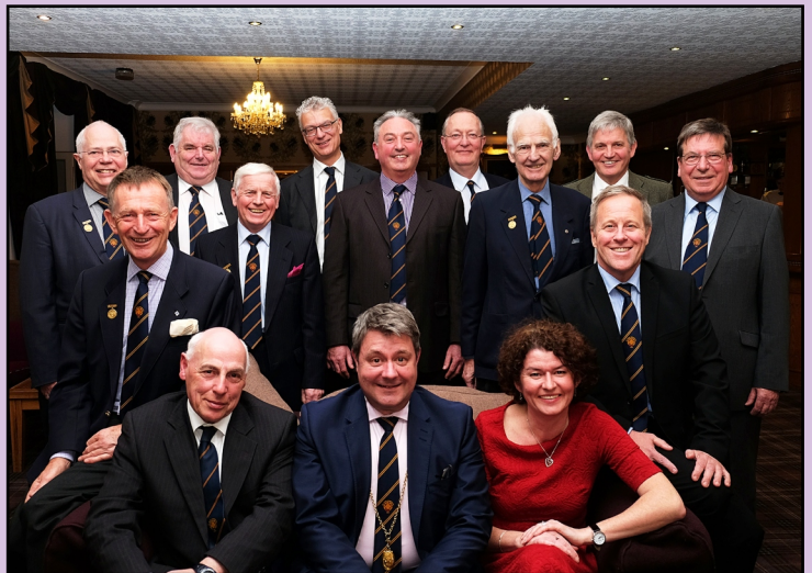
The Ex-Deans' Dinner

Work has been going on at our various properties; new detectors and alarms have been fitted in the High Street and at Craigmakerran, and the flats have also had new glazing installed. Major drainage repairs have been carried out at Hallroom, and work is planned for the farm cottages there too.