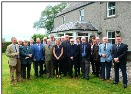
The Inspection party at Loanhead