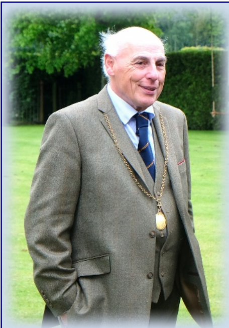
The Dean in relaxed mode at Loanhead