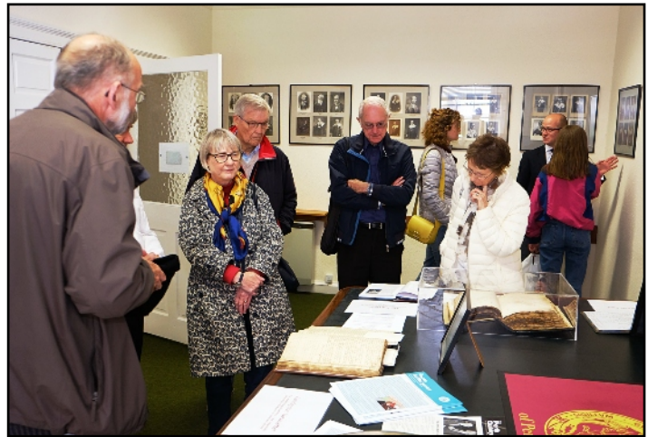
Visitors showed a keen interest in our main display